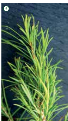
1 Manuka – Leptospermum scoparium 2 lemon grass – Cymbopogon citratus 3 thyme – Tymus vulgaris 4 tea tree – Malaleuca alterifolia

Essential oils are effective against aggressive periodontitis pathogens like Aggregatibacter , Porphyromonas and Prevotella , but also against the dreaded MRSA – methicillin resistant staphylococcus aureus strains . Tea tree oil ( Melaleuca alternifolia ) has proven especially effective against MRSA 2 . Based on previous clinical experiences essential oils are also suitable for treatment of respiratory tract, skin and vaginal disease